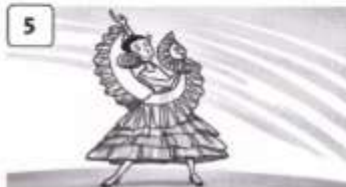
5 nSapi _____