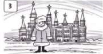
3 uRsasi _____