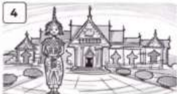
4 ndiaThal _____