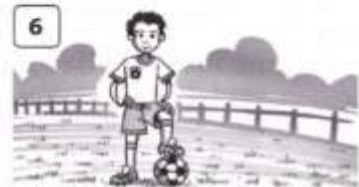
6 zirlBa _____