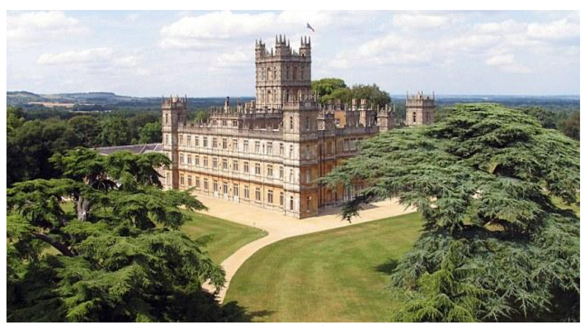
Highclere Castle, Location for Downton Abbey

Author of <u>Cotswolds Memoir</u>: Discovering a Beautiful Region of Britain on a Quest to Buy a 17<sup>th</sup> Century Cottage (Larrabee Libraries)