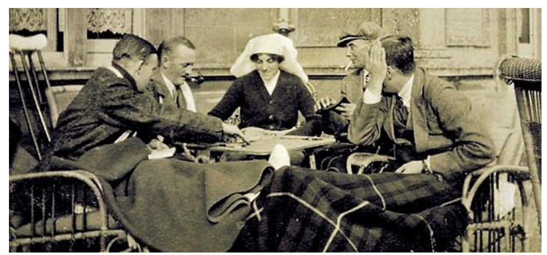
Highclere Castle in the Great War

During the First World War Highclere Castle was turned into a hospital by Amina the 5<sup>th</sup> Countess of Carnarvon which treated soldiers wounded in Flanders in September 1914. The Castle became a private home again in 1922. The Castle was used again in the Second World War as a home for evacuated children from London.