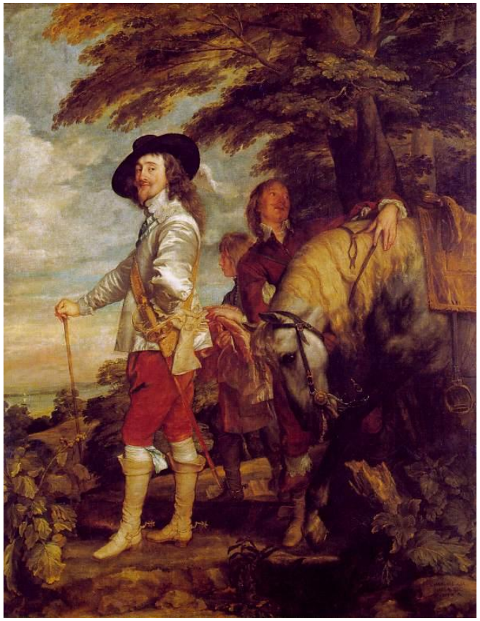
Charles I by Van Dyck

There are 11 bedrooms on the first floor of Highelere Castle with approximately 60 bedrooms on the upper floors.