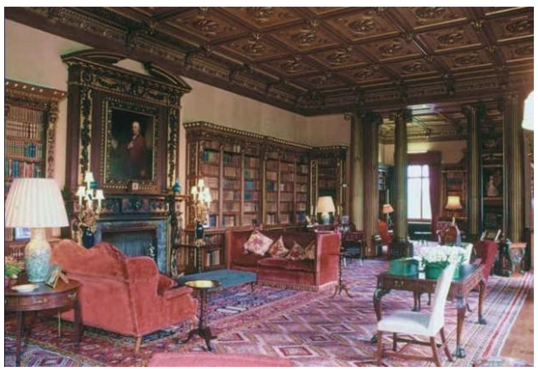
Highclere Castle Library