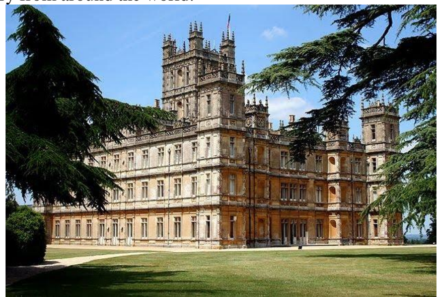
Highclere Castle Today

trajectory since the First World War. The curiosity aroused by this well-loved series has promoted a thirst for knowledge about British architecture and history from around the world.